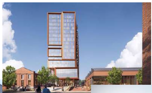
417 Communipaw Ave.