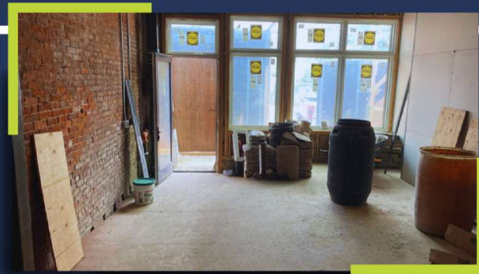
VANILLA BOX DELIVERY