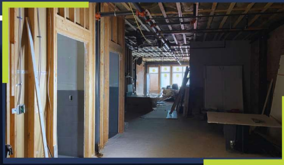
SUMMER 23 DELIVERY