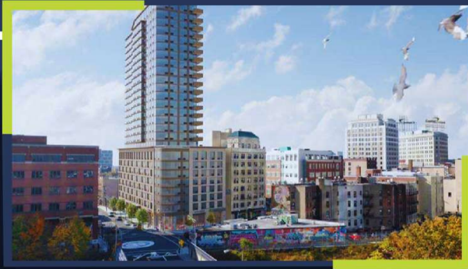
425 SUMMIT AVE