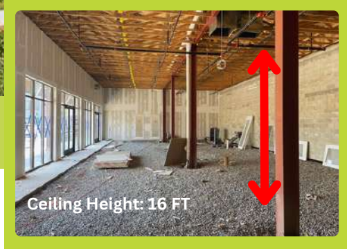
Ceiling Height: 16 FT